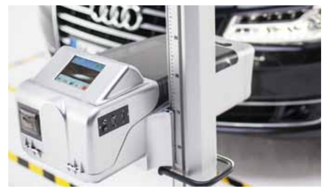
Headlight tester MLD 815