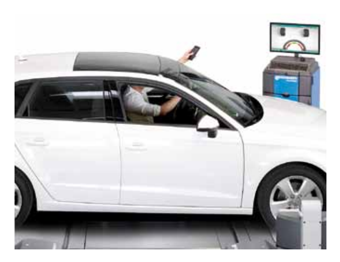
Touchless: wheel alignment from the driver's seat