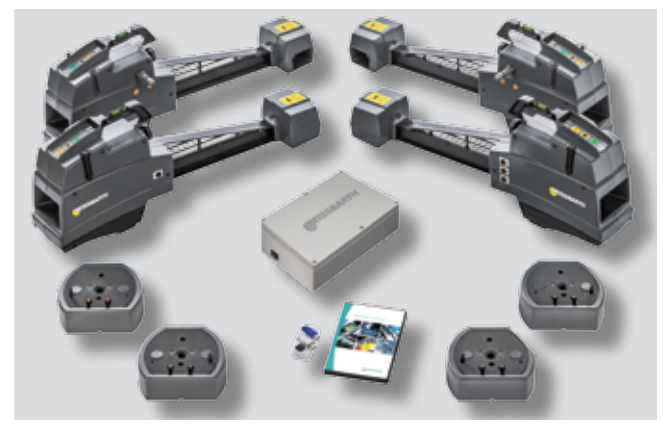
Easy CCD Kit: the basic version