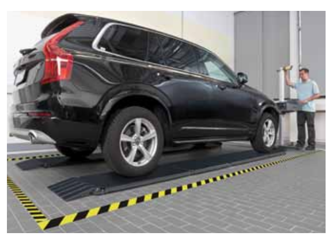
Leveled test bay LTB 100 in compliance with § 29 of the General Inspection Testing Guideline of the German Road Traffic Approval Regulation