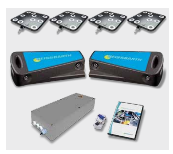
Scope of delivery for the Easy 3D+ Kits