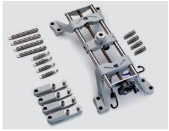
Turnplates/multi-fit clamps: optional connection of electronic turnplates mechanical turnplates and universal multi-fit clamps in the basic version