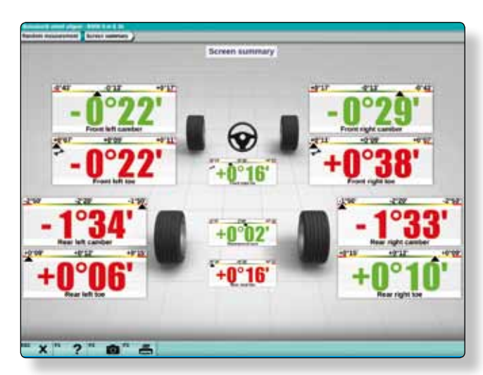
Quick and easy operation, measurement and display of precise readings

With modern wheel alignment equipment by Beissbarth, a workshop can adjust the relevant components with precision and deliver exact steering wheel alignment, great ride comfort and safe road-holding characteristics