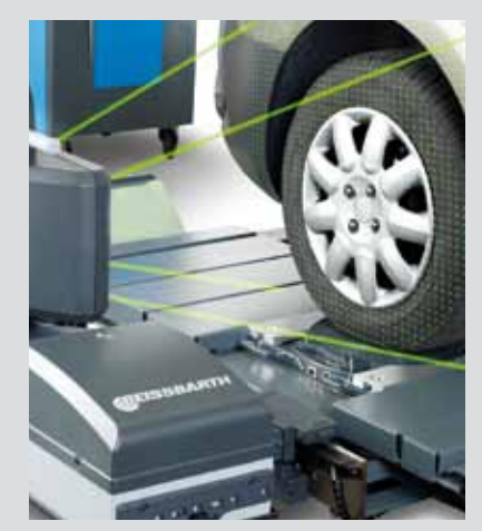
Easy CCD: CCD wheel alignment