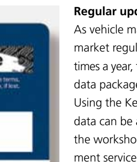
Just scratch until the access information is visible and log in.