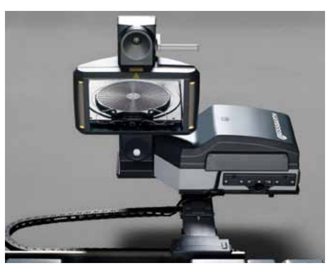
Touchless: reference system and 3D stereo cameras