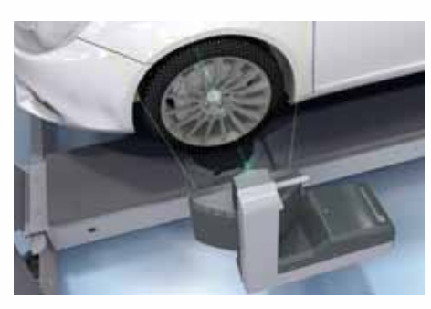
High-frame-rate digital image processing generates a 3D model of the wheel.