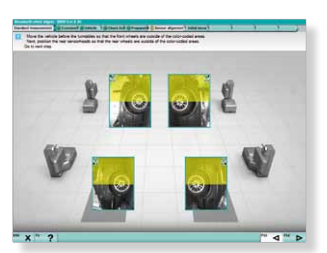
Smart Align: intelligent alignment software