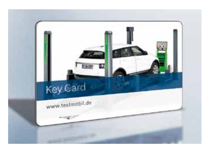
Accessible by card: 35 000 vehicle setup data sets from 130 manufacturers